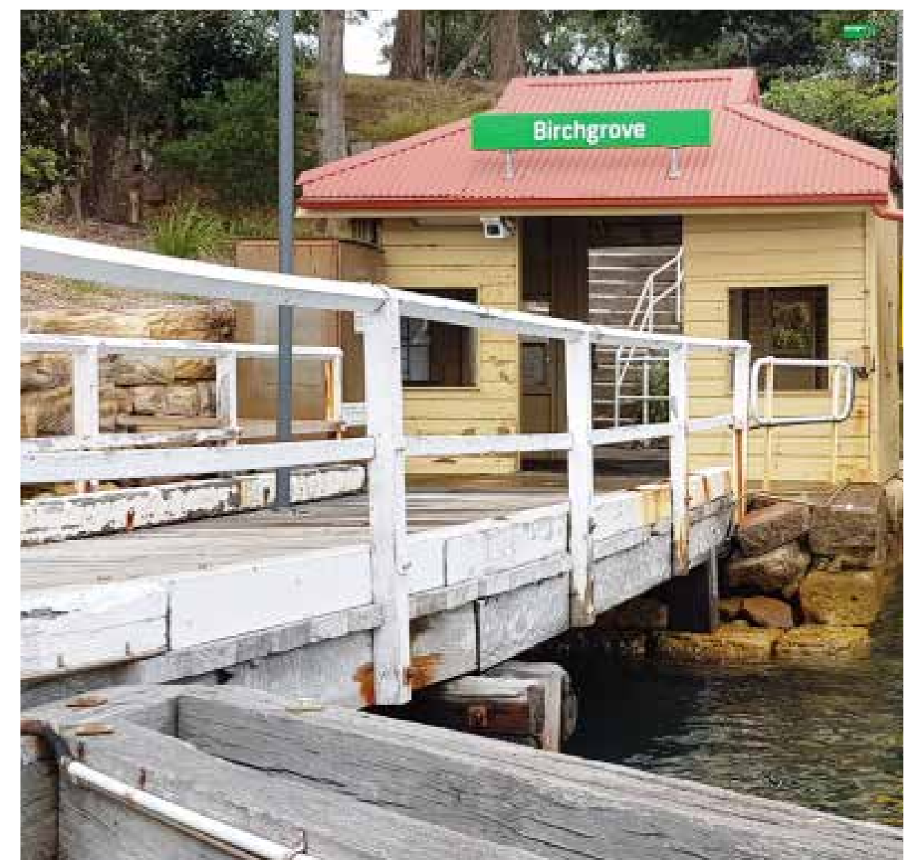
The existing timber waiting shelter

The proposed upgrade of Birchgrove Wharf is part of a wider program of transport improvements for the Parramatta River, with upgraded wharves, new ferries and increased ferry services planned for the area.