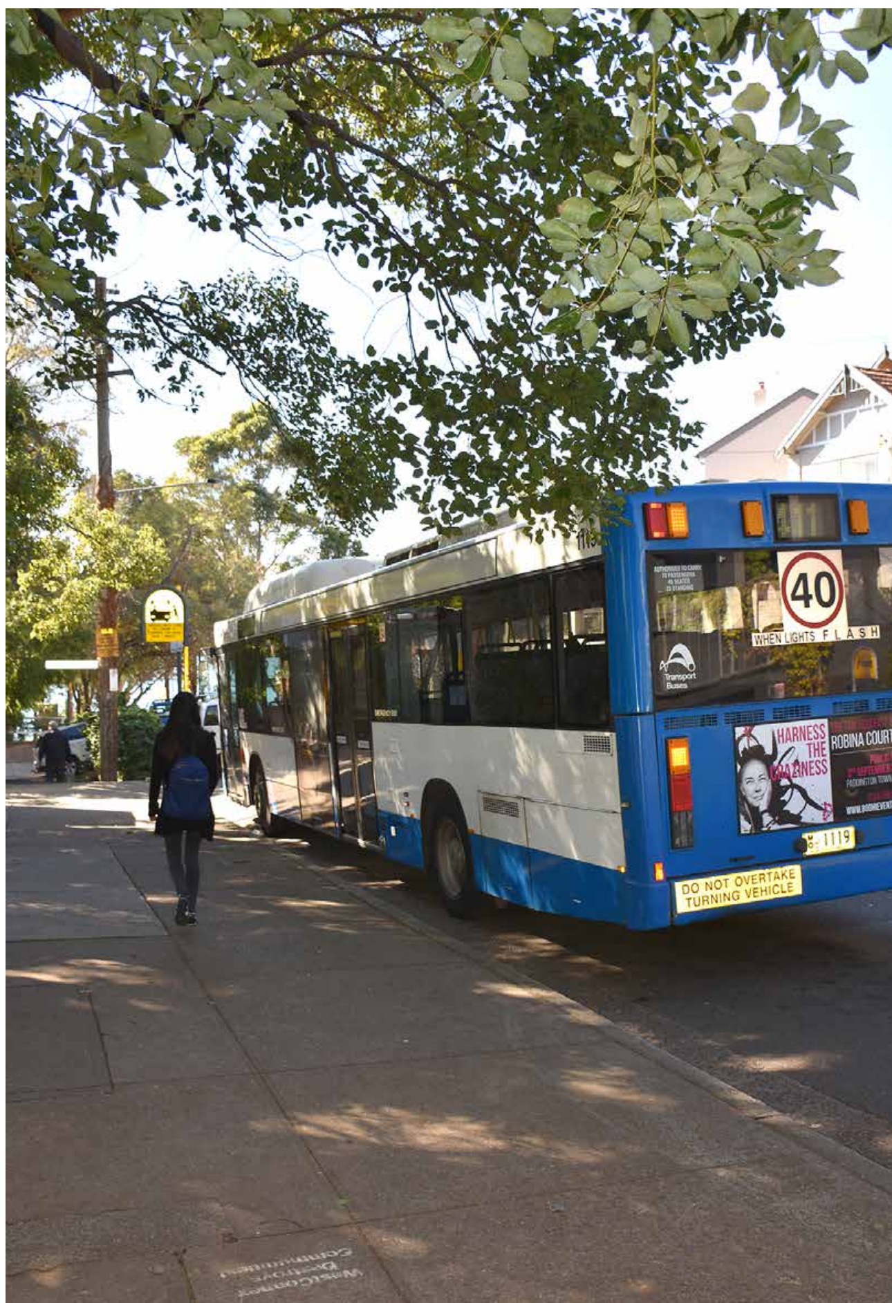
Bus stop at Grove Street

We encourage customers to plan their trip by visiting transportnsw.info or calling 131 500 before starting their journey. Customers would need to allow extra time for their journey.