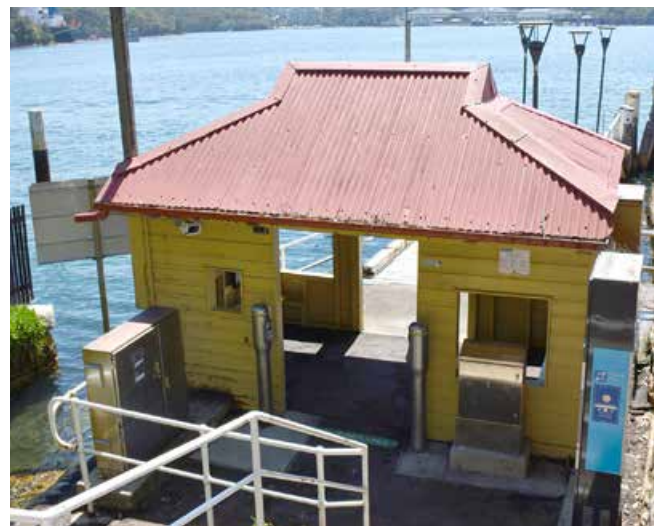
The existing waiting shelter

Visit the Roads and Maritime Services website: rms.nsw.gov.au/wharfupgrades