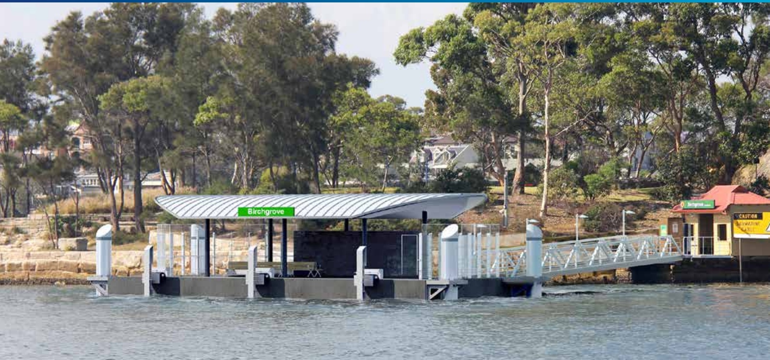
An artist's impression of the proposed new Birchgrove Wharf viewed from the water