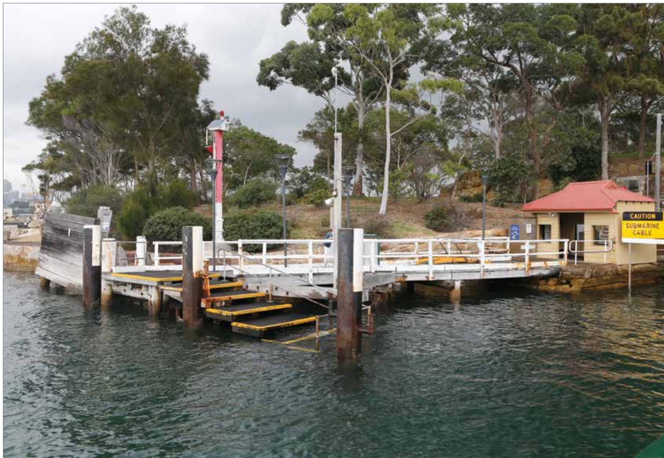
The existing wharf viewed from the water