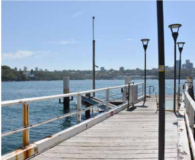
The existing wharf

The new wharf would incorporate a new floating pontoon connected to the existing timber waiting shed by a gangway and fixed bridge. The pontoon would have a curved roof, new seating and glass weather protection panels. The gangway would be uncovered. Some maintenance work would be carried out on the existing waiting shelter.